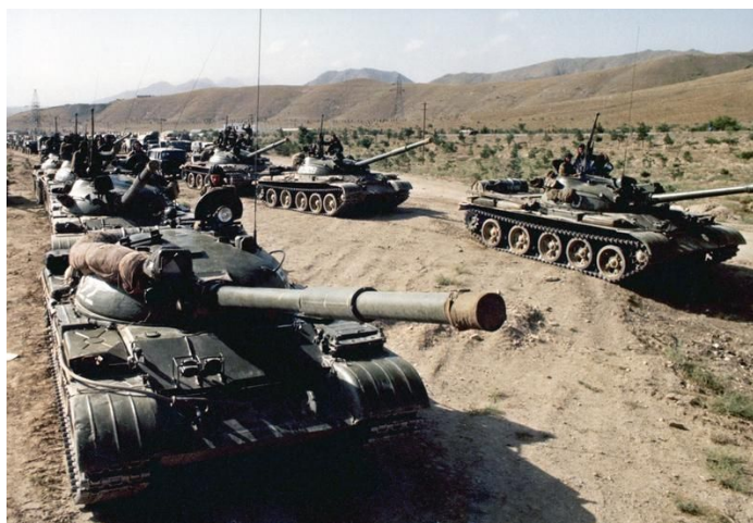
Soviet troops on the move in Afghanistan, mid-1980s