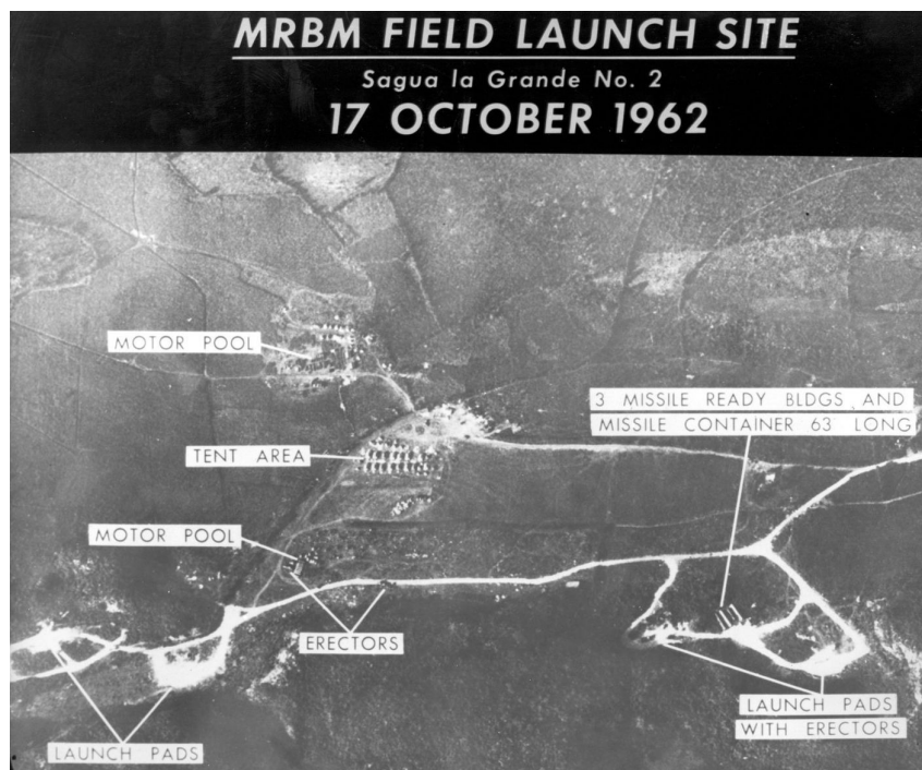
An aerial view showing the medium range ballistic missile field launch in Cuba

Directions: Read the excerpt below and respond to the questions.