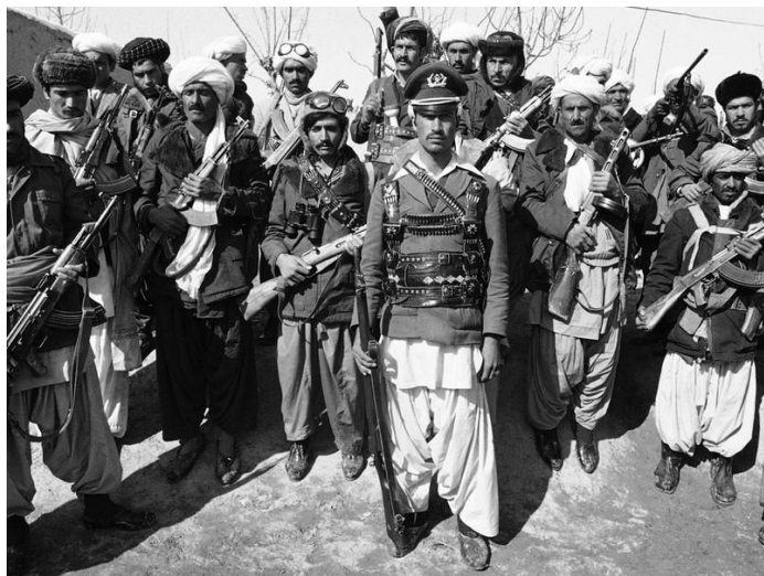
A mujahideen, a captain in the Afghan army

Directions: Read the excerpt below and respond to the questions.