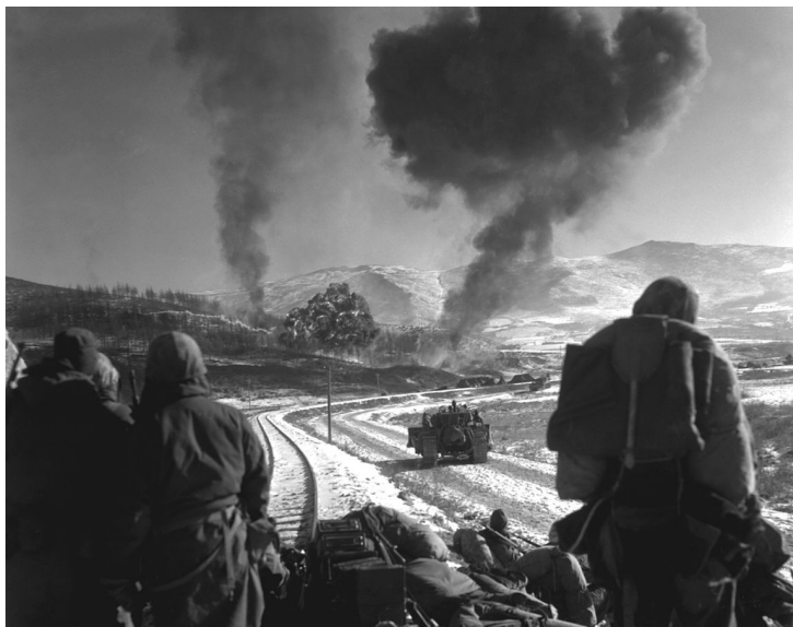
Photograph of US Marines fighting to help the South Koreans watching bombs explode on Chinese troops who assisted North Korean troops in December, 1950.