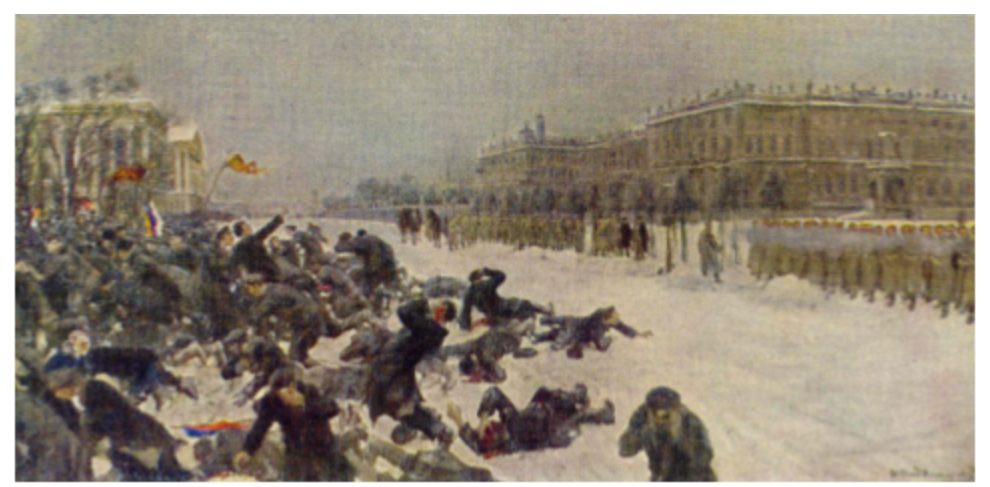
Painting commemorating Bloody Sunday created before 1917.

1904 was a bad year for Russian workers. Prices of essential goods rose so quickly that real wages declined by 20 per cent. When four members of the Assembly of Russian Workers were dismissed at the Putilov Iron Works, Gapon called for industrial action. Over the next few days, over 110,000 workers in St. Petersburg went out on strike.