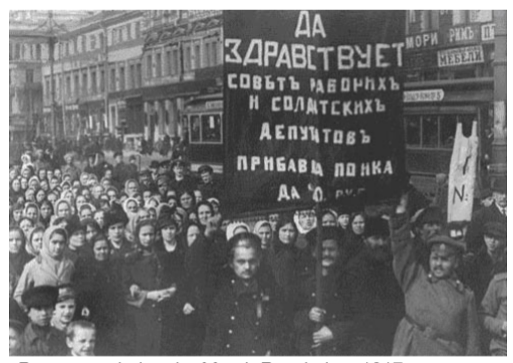
Protesters during the March Revolution, 1917.