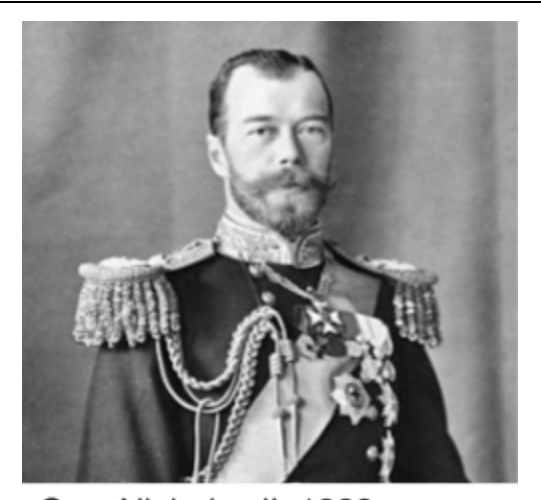
Czar Nicholas II, 1909.

https://commons.wikimedia.org/wiki/File:Nicholas_II_by_Boissonnas_ %26_Eggler_c1909.jpg