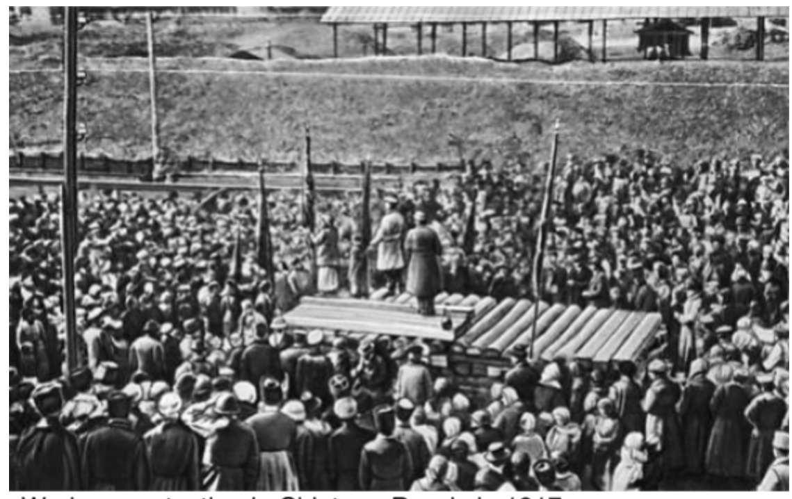
Workers protesting in Chiatura, Russia in 1917.

In 1903, Russian Marxists split into two groups over revolutionary tactics. The Mensheviks wanted a broad base of popular support for the revolution. The Bolsheviks supported a small number of committed revolutionaries willing to sacrifice everything for radical change.