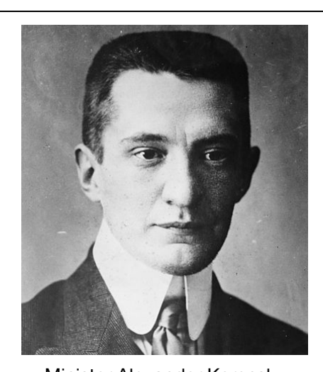
Minister Alexander Kerensky