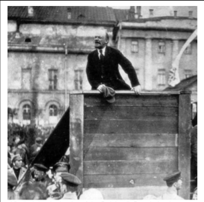
Vladimir Lenin, leader of the Bolshevik Revolution in 1917 speaking to troops in 1920.

https://commons.wikimedia.org/wiki/File:Nicholas_II_by_Boissonnas_ %26_Eggler_c1909.jpg